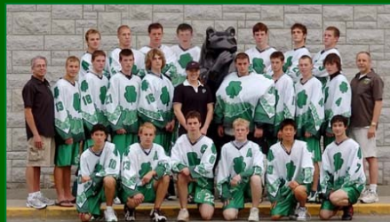
Intermediate "A" Shamrock Lacrosse 2007