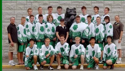
Intermediate "A" Shamrock Lacrosse 2007