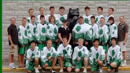
Intermediate "A" Shamrock Lacrosse 2007